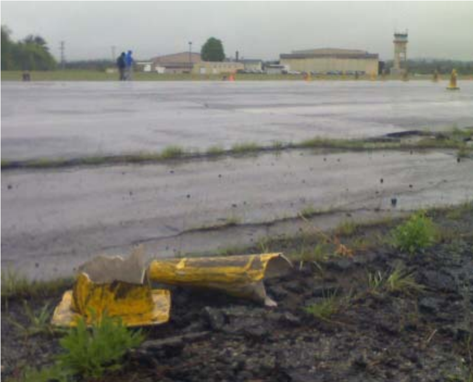
Slalom cone split in half during Phase 1 school Saturday

Phase 1 is appropriate for complete novices, but is also a good beginning-of-the-season refresher for those of us who can't autocross year-round. Most of the emphasis is on car placement and looking ahead, so there are no surprises while you're driving. The first three runs of the day are timed, then compared with the last three runs of the day.