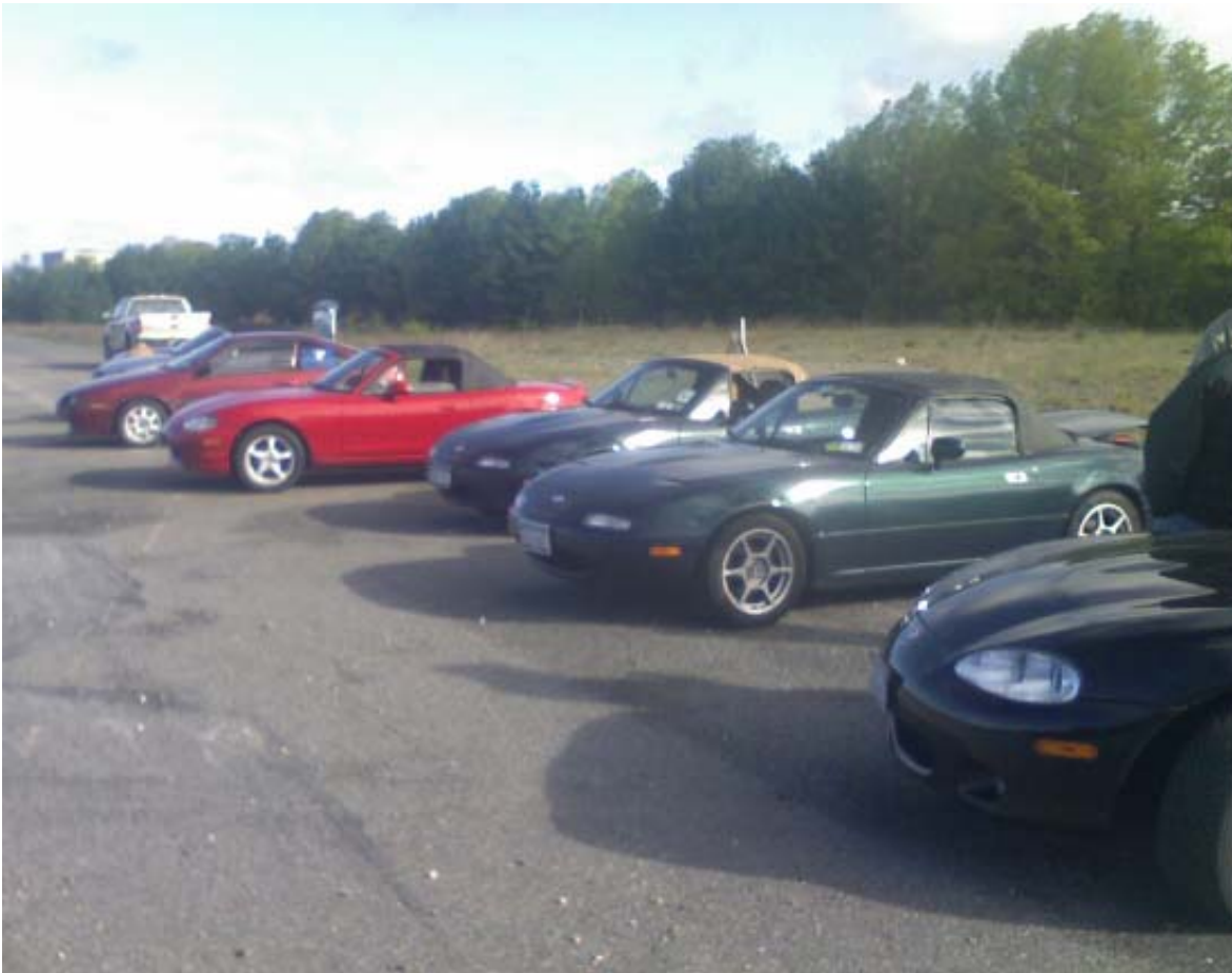
Five MoHud drivers brought their four Miatas for the Sunday sessions