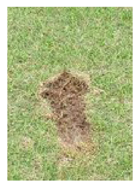
FYI: Divots won't be counted! A divot is the scar left behind when turf is "dug up" by a golf club.

$33 per person includes golf cart, food and awards (really?) Thanks Dick again!