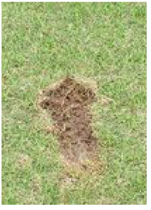
FYI: Divots won't be counted! A divot is the scar left behind when turf is "dug up" by a golf club.