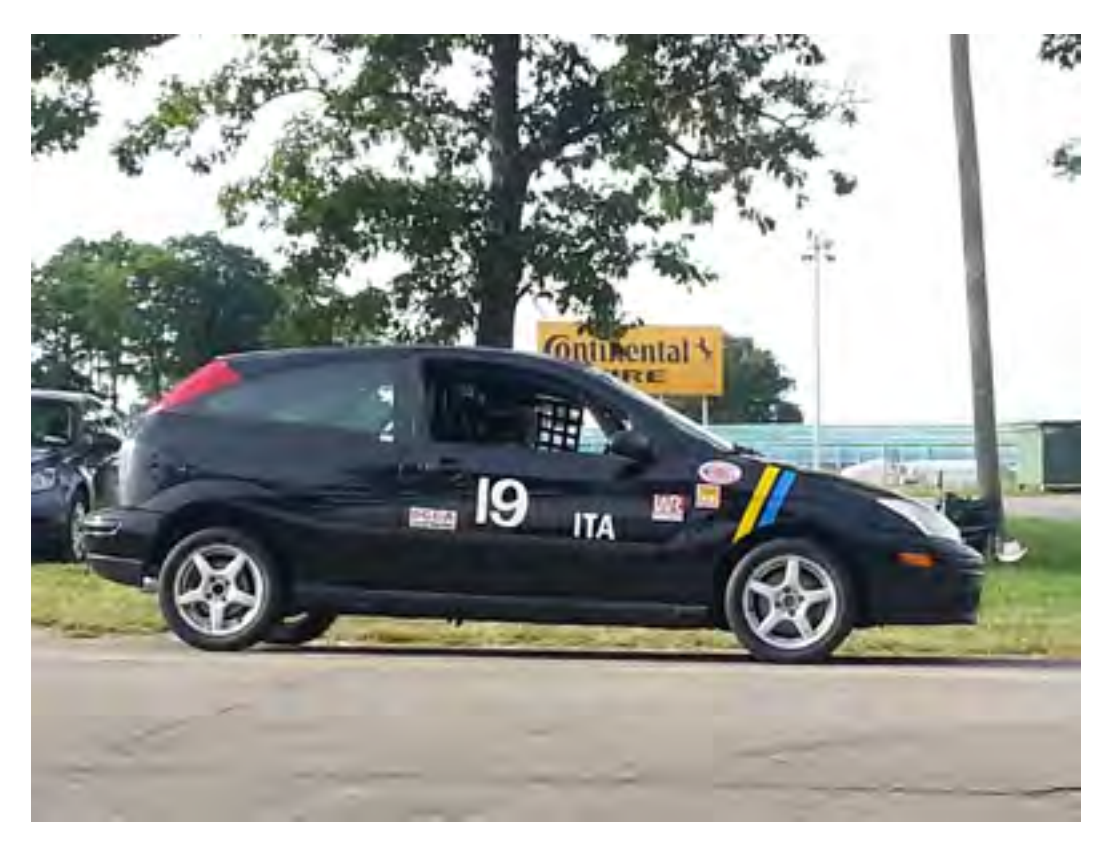
Jim Bucci on the qualifying grid in the Ford Focus