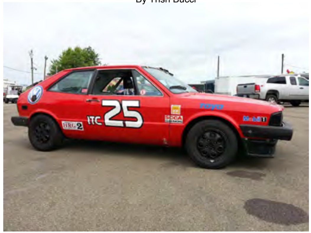
Thom O'Connor's Scirocco