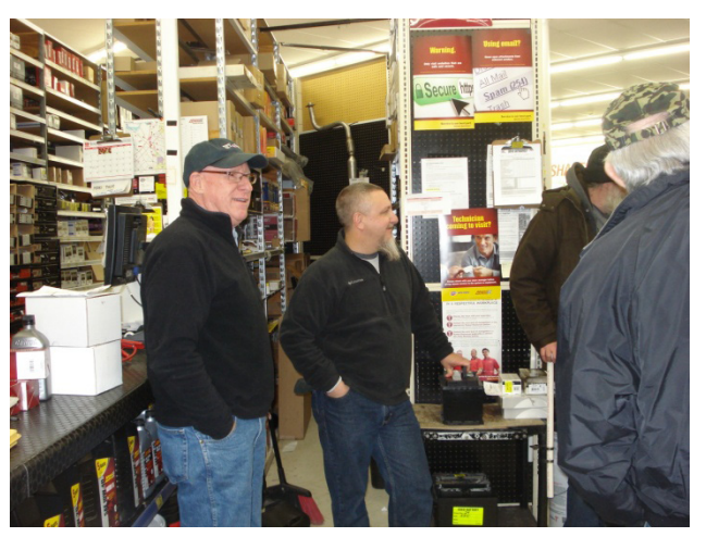
Some entrants took the time to check out the instructions, ask questions, and figure out how to calculate.