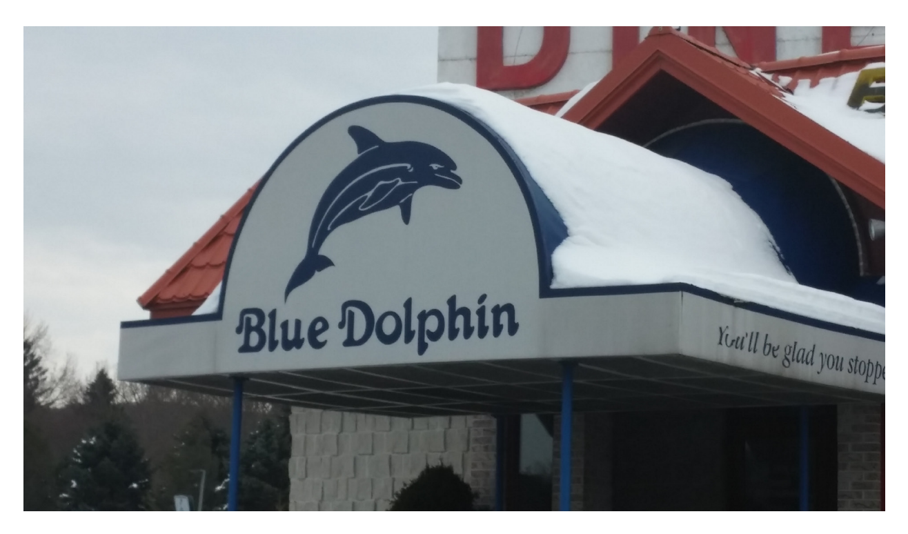
No trip to the Finger Lakes region is complete without a stop at the Blue Dolphin Diner on the way home