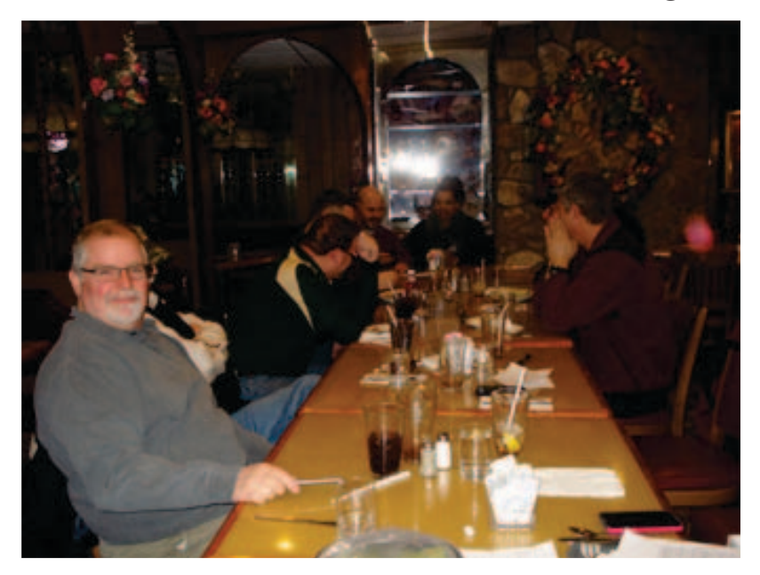
Relaxing at '76 Diner in Latham after the rally