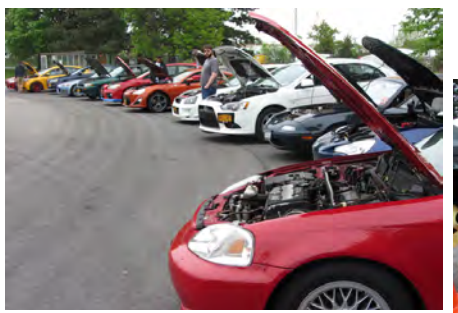
Lined Up for Tech