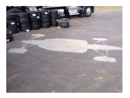
Formula F footprint...