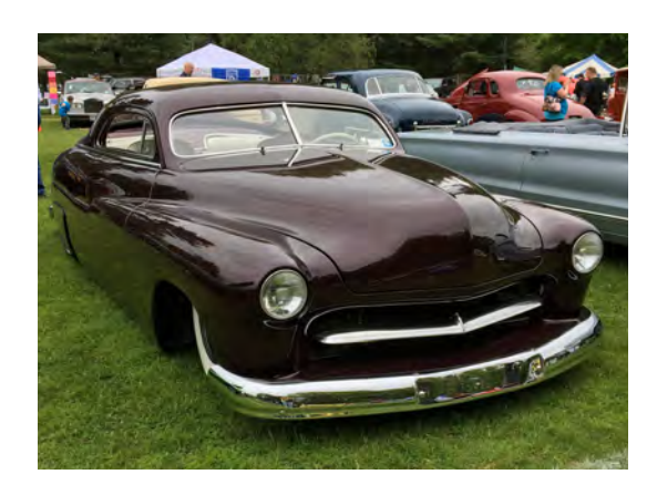
Chopped & bobbed, shaved, decked, frenched; with skirts and lowrider hydraulics.