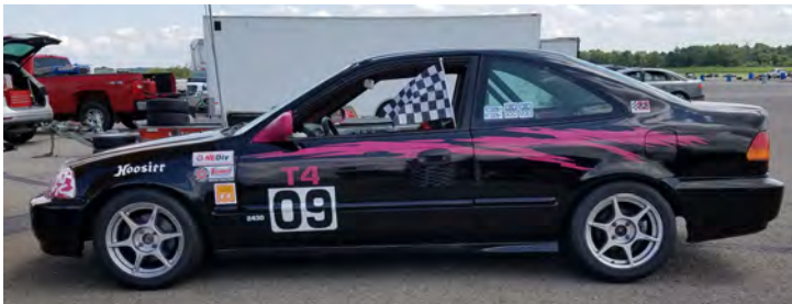
Jim Bucci Hides Boundary Layer Control in Plain Sight

(hint: it's tiny bubbles on the graphic)