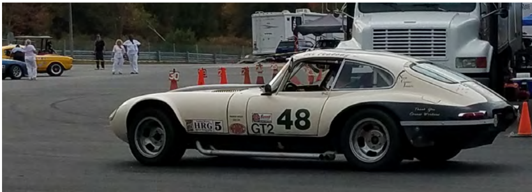
The Exhaust Note from Scott Stickle's E-Type Rattles Teacups for Miles Around