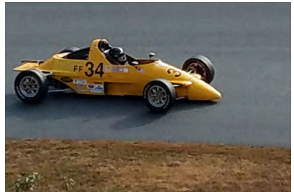
Chip VanSlyke Aims for the Apex

(hint: it's tiny bubbles on the graphic)