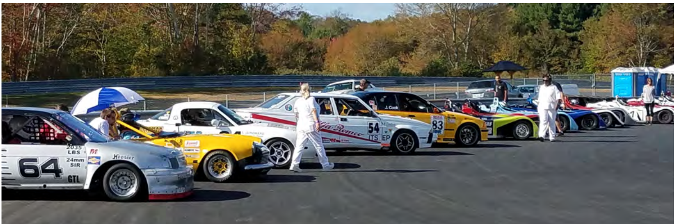
On the Grid for the Group 3 Race