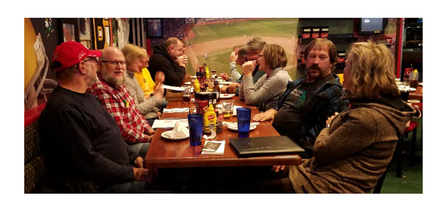
Bench Rallying Afterward!