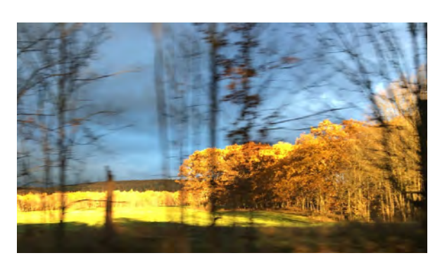
Along the Route, Late Fall Colors a Blur....