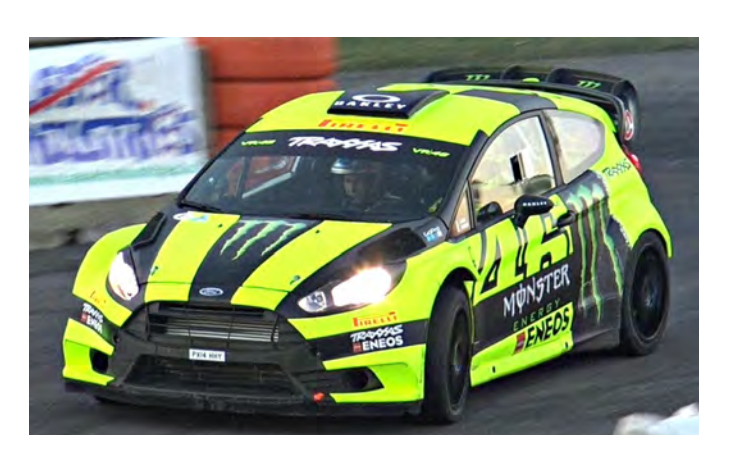
Vintage Valentino Rossi