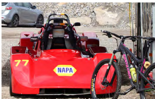
Charging into Turn 1 at Palmer ... and resting afterward

Ice racing as cross-training for wet conditions? We see that he's run this February in an AME event on Lake George.