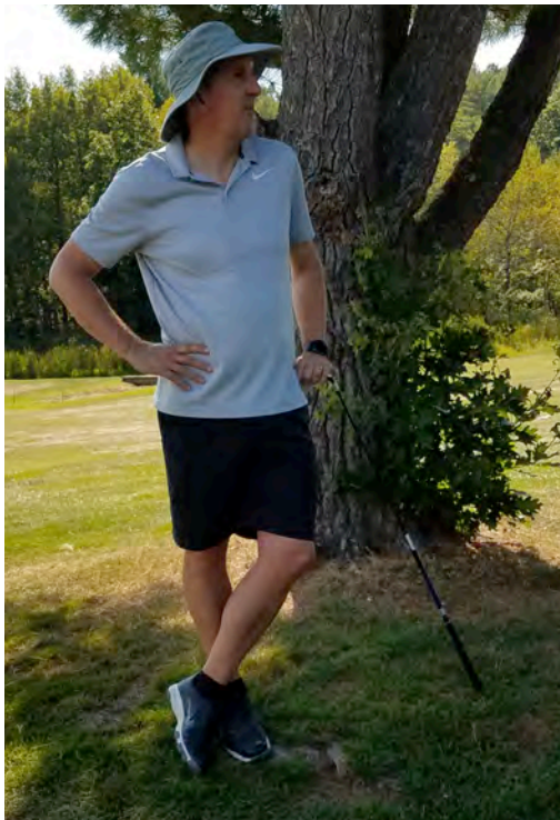
Andy Stewart or Sir John Gielgud? You choose...