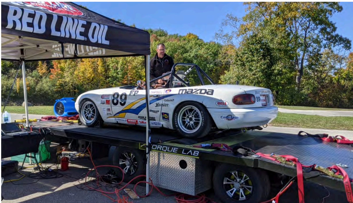
On the Dyno

Monday was test day for the SM car. There were only three sessions and they, also, went well. Also on Monday, we took the FP car to the dyno and the engine builder did some tuning magic that only he can do. He does this each year at the Runoffs and it keeps the engines running with as much power as they are capable of.