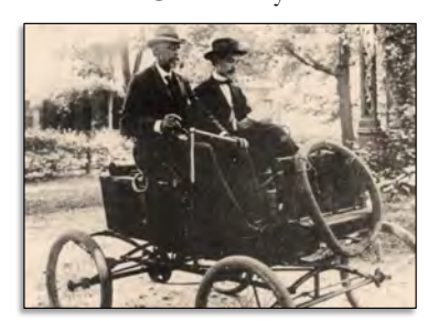
GAME - TOUR - ADVENTURE