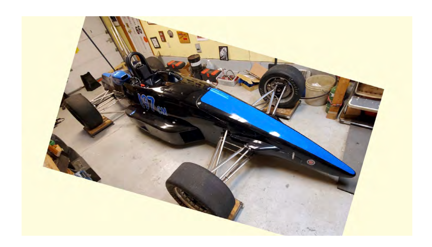
1994 Citation FF being built in Jim's garage January 2022