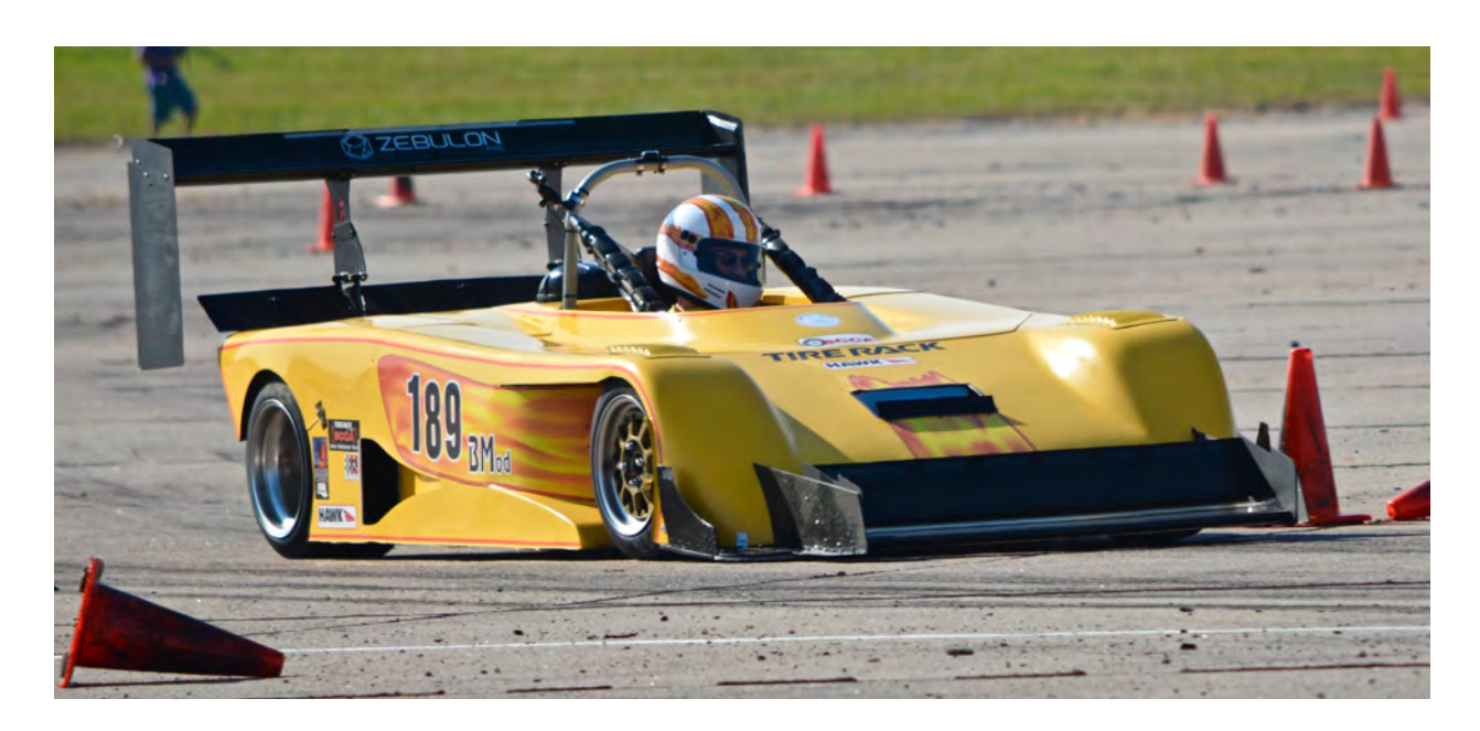
2018 Nationals at Lincoln, NE in the 1998 Cheetah.

When we tried to roll the car out of the garage, the engine/transmission was bound up solid. We were too exhausted to tear things apart again. So we headed home very bummed out. Turns out a gear had been installed "inside out". If the gearbox was stock, that gear would have been fine the way we had it. But the somewhat common mod that we had made the year before required the gear to be reversed. Didn't discover the problem until a week after I got home. That was a tough one because of all the time we put into it.