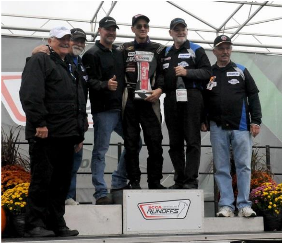
The team of Campbell Racing

All of these people are vital members of the team but more important to me, they are all my good friends. I sincerely thank them all for both their contributions and their friendship.